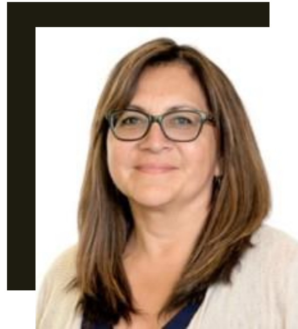
LORETTA ROSS Treaty Commissioner