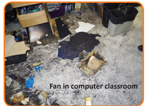
Fan in computer classroom