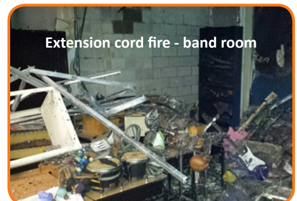
Extension cord fire - band room

Since 2004, we have paid out $1,976,924.80 in electrical claims alone, which could have been prevented.