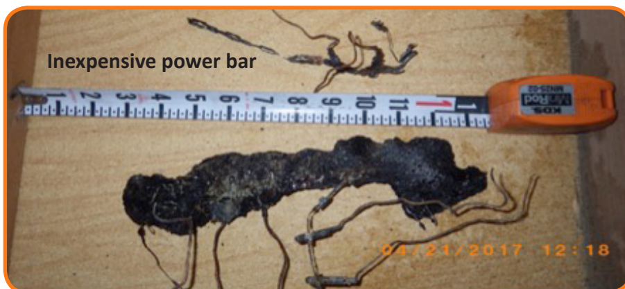
Inexpensive power bar